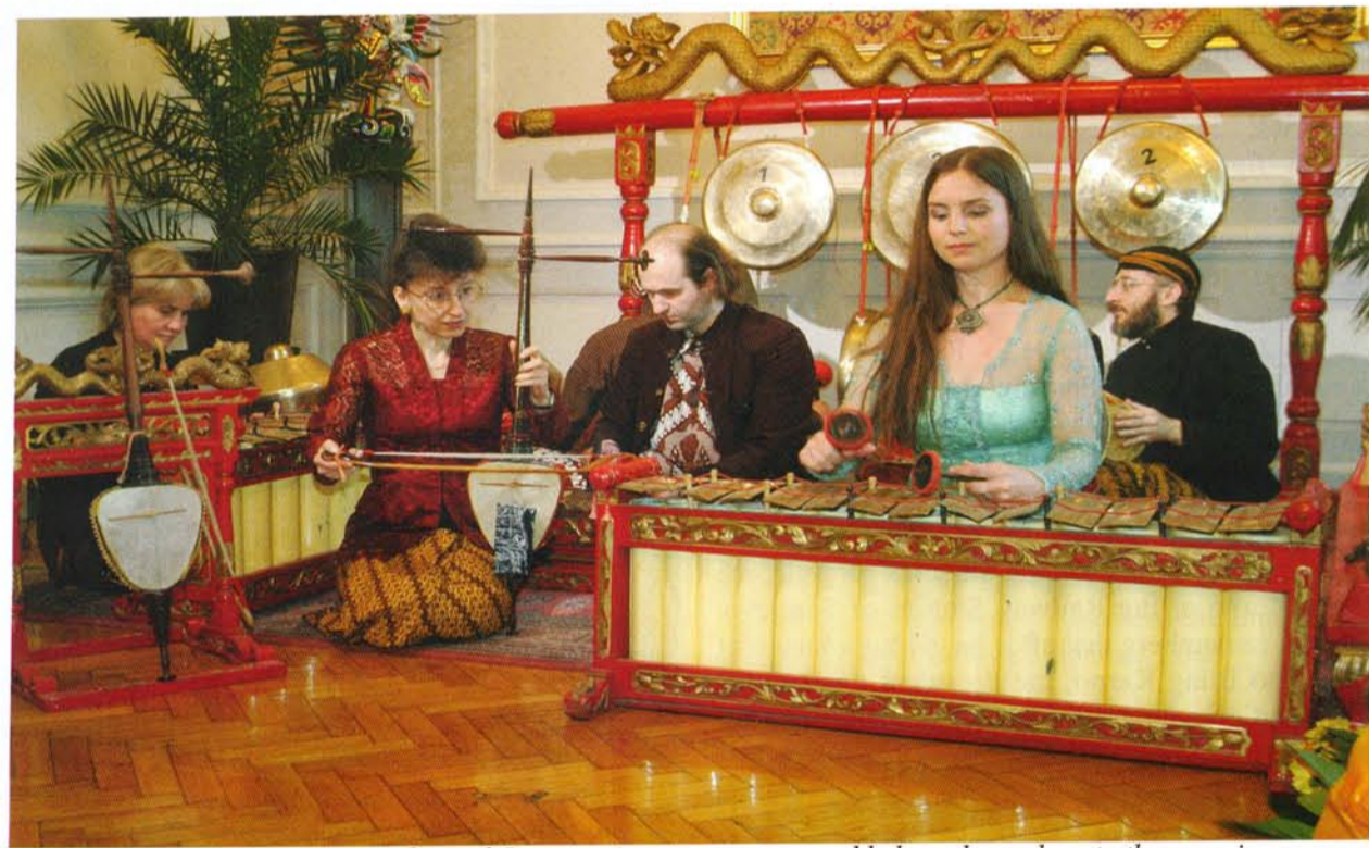
Topong Bang group, a traditional Javanese instrument group added another colour to the occasion